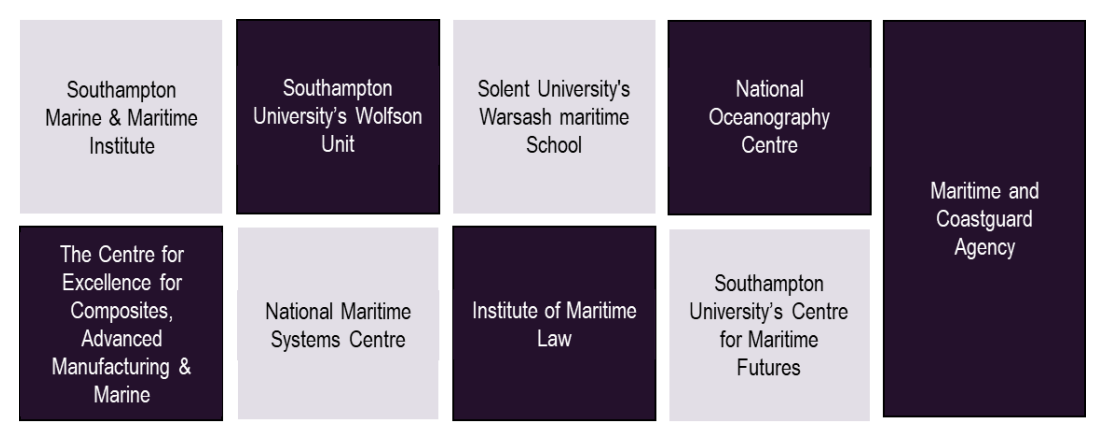
The Solent's leading marine and maritime establishments

The Solent boasts world-leading marine and maritime research establishments. For example, the National Oceanography Centre (NOC) in Southampton undertakes research in large scale oceanography and ocean measurement technology, working with Government and business to translate the latest research and technology into practical advice and applications. A number of important marine and maritime establishments based in the Solent are highlighted below.